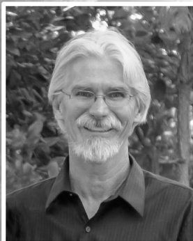
Host of The Narrow Path on KFIA